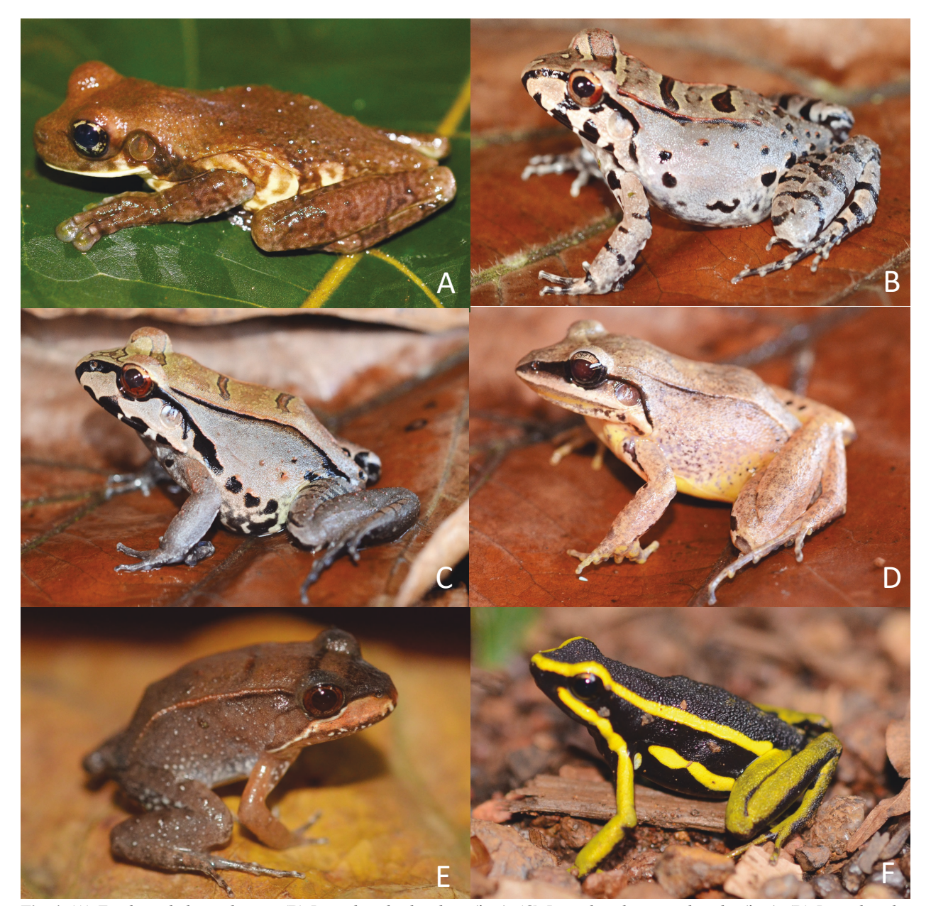
Fig. 4. (A) Trachycephalus typhonius; (B) Leptodactylus knudseni (juv.); (C) Leptodactylus pentadactylus (juv.); (D) Leptodactylus mystaceus; (E) Leptodactylus rhodomystax (juv.); and (F) Ameerega trivittata.