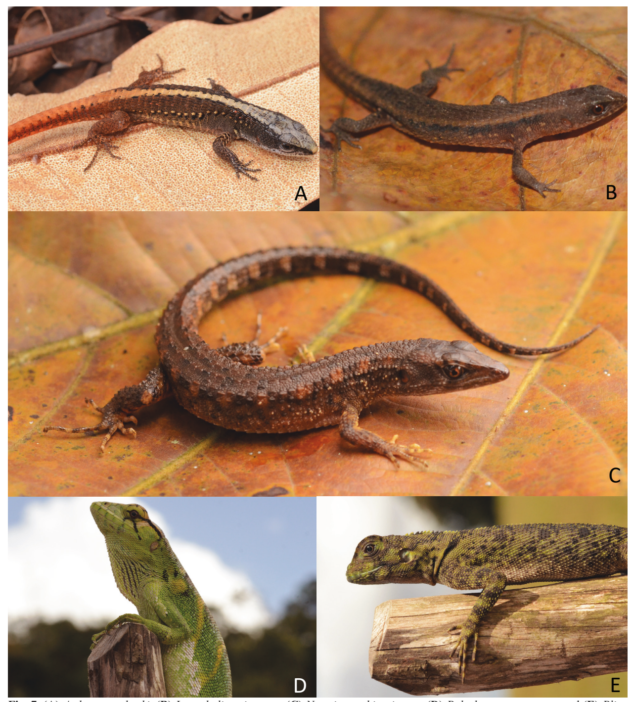
Fig. 7. (A) Arthrosaura kocki; (B) Loxopholis guianense; (C) Neusticurus bicarinatus; (D) Polychrus marmoratus; and (E) Plica umbra.

National Park, Guyana. Zootaxa 1238: 35–61.