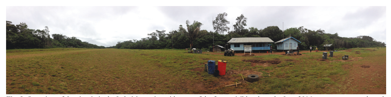
Fig. 9. Overview of the airstrip in the Lely Mountains with parts of the forest visible where the June 2016 surveys were conducted.