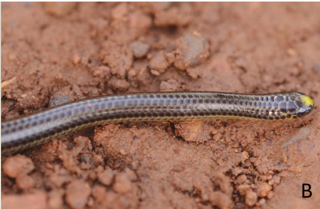
Fig. 8. (A) Chironius fuscus; and (B) Epictia tenella.