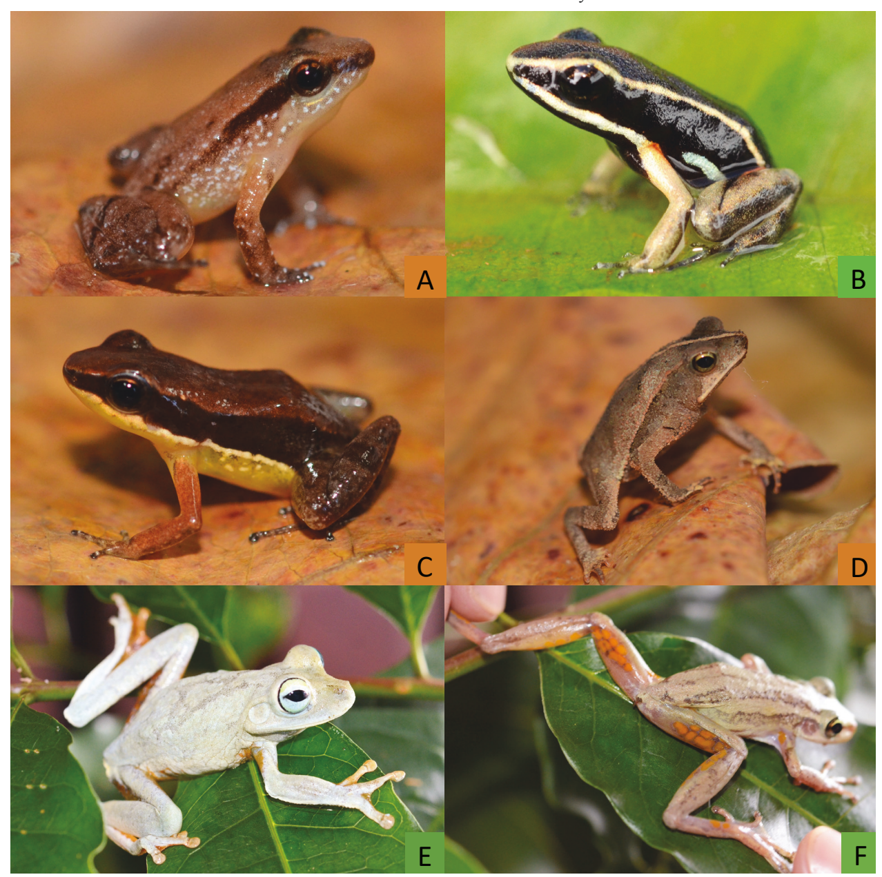
Fig. 3. (A) Anomaloglossus stepheni; (B) Allobates femoralis; (C) Allobates granti; (D) Rhinella martyi; (E) Boana xerophylla; and (F) Scinax ruber.