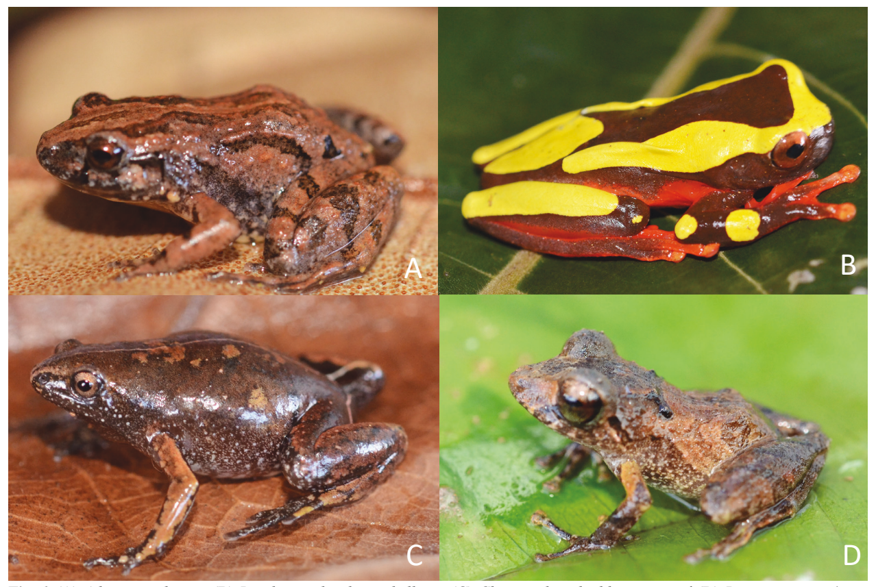
Fig. 6. (A) Adenomera heyeri; (B) Dendropsophus leucophyllatus; (C) Chiasmocleis shudikarensis; and (D) Pristimantis sp. 4.